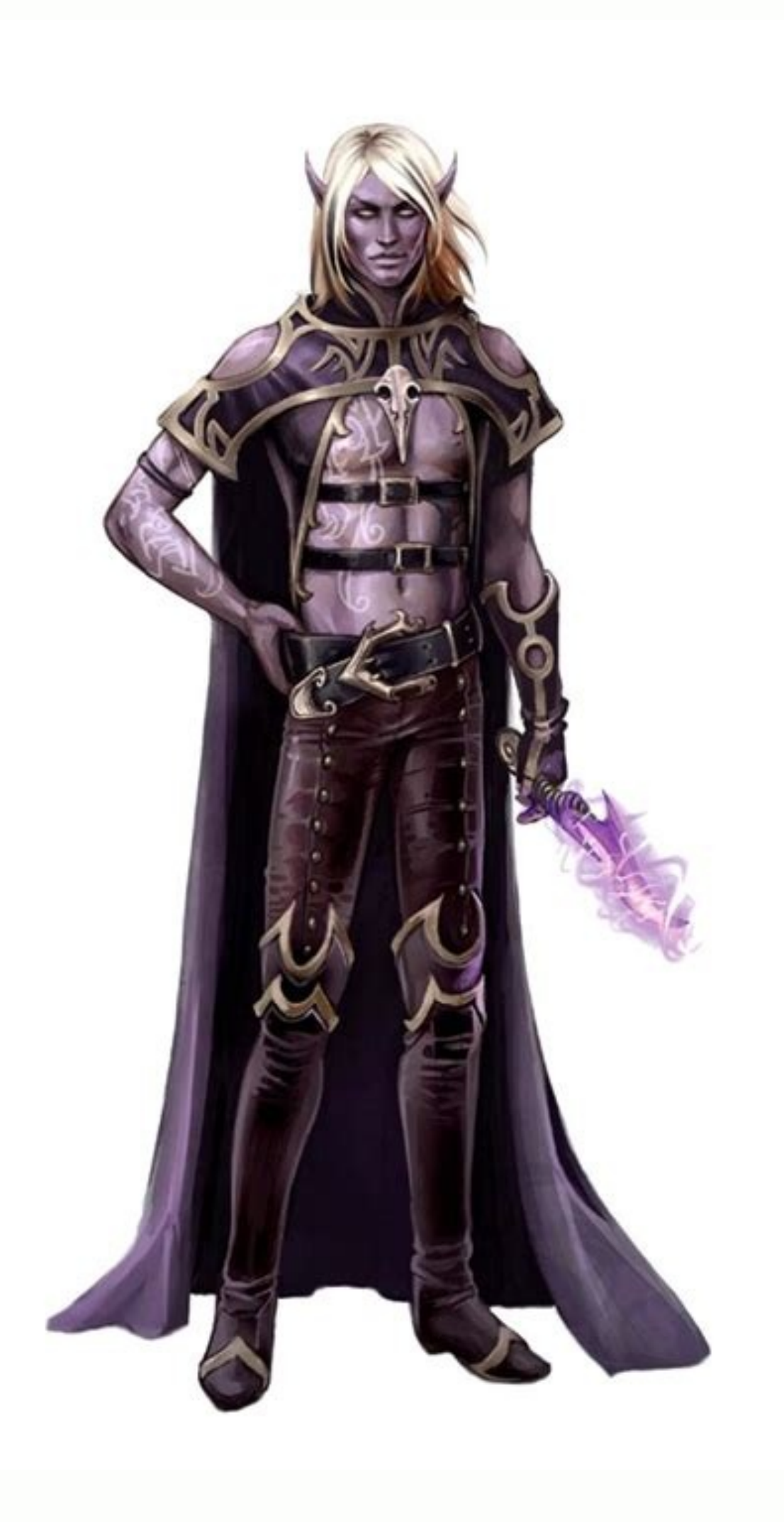
Rise of the ghosts expansion review. Rise of the drow 5e review.